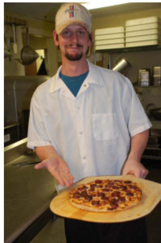
And a Halfway Holbrook Favorite: Mac & Cheese w/Hot Dogs Pizza!!!